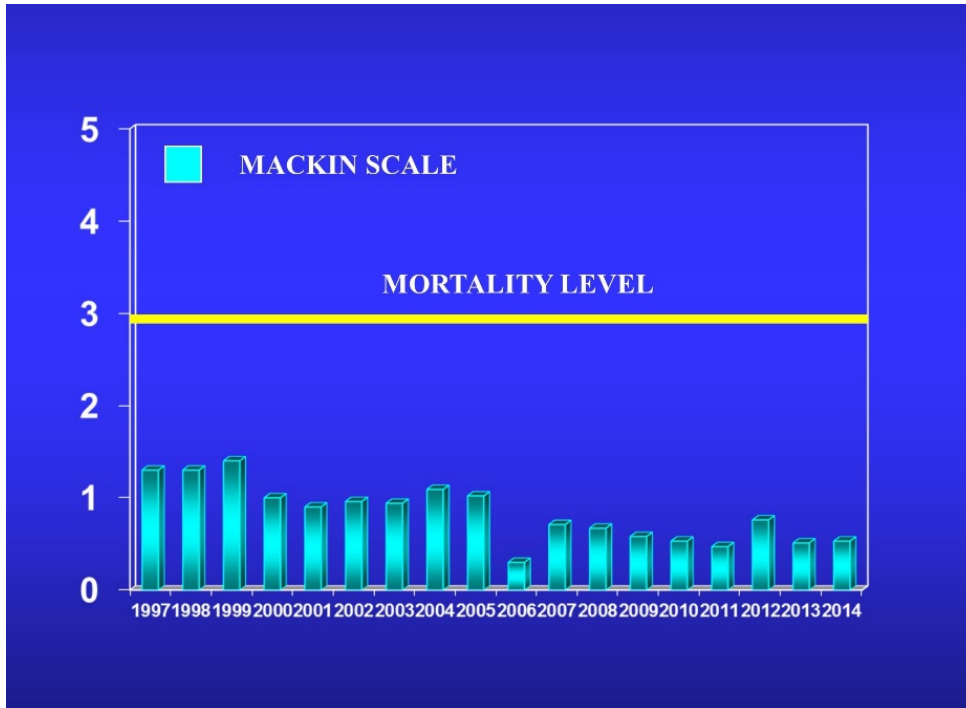
Fig. 3. Intensity of Dermo, Perkinsus marinus , in Connecticut in market-size oysters. Mackin Scale ranges from 0, when no parasites are detected to 5, when a high number of parasites infect the oyster.